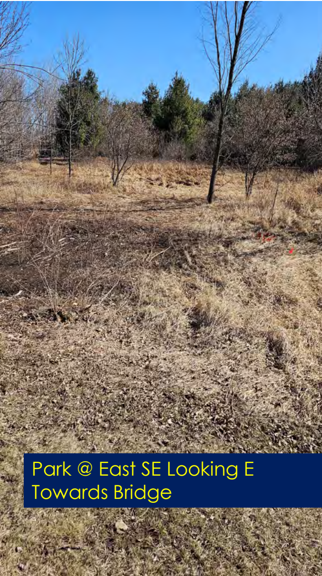
Park @ East SE Looking E Towards Bridge