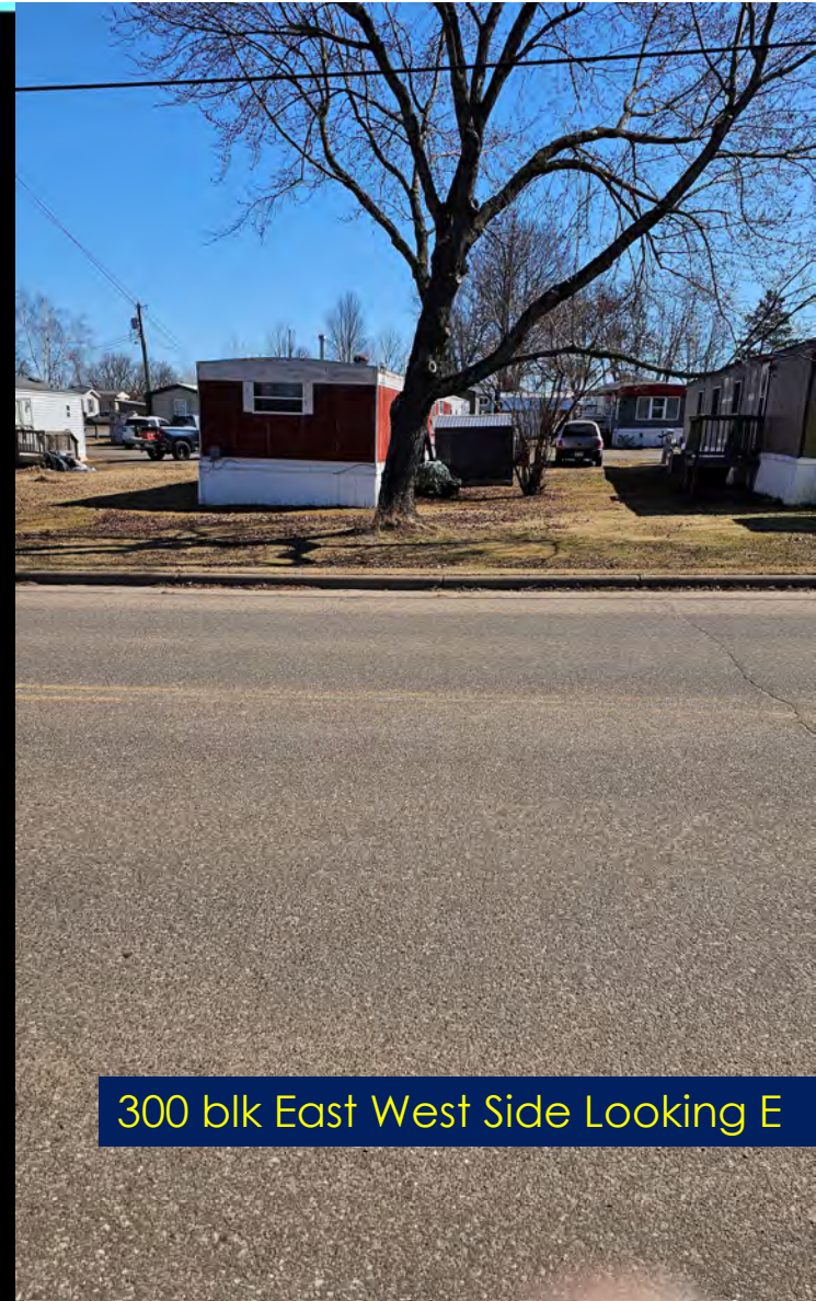
300 blk East West Side Looking E