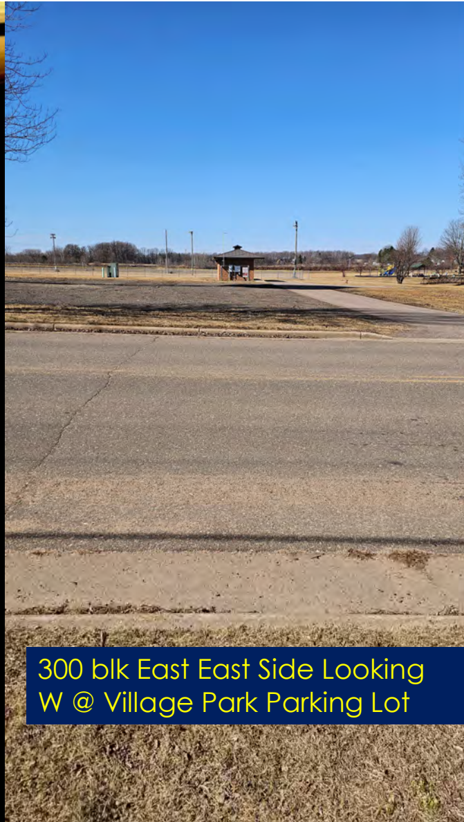
300 blk East East Side Looking W @ Village Park Parking Lot