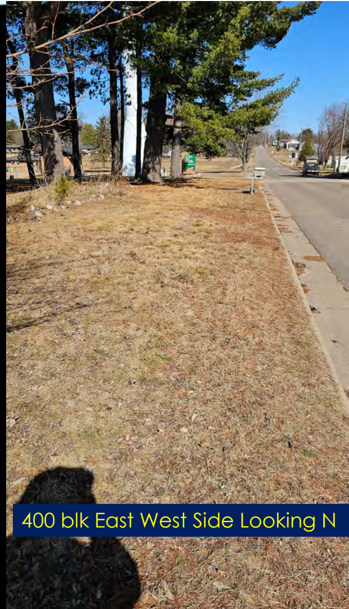
400 blk East West Side Looking N