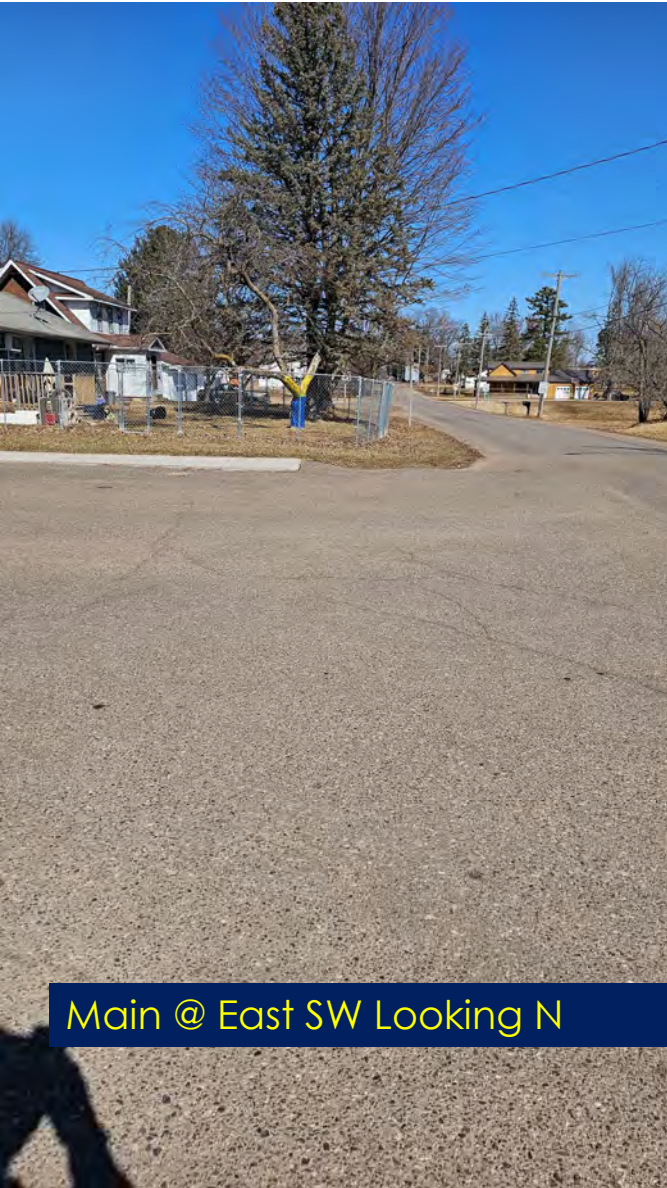
Main @ East SW Looking N