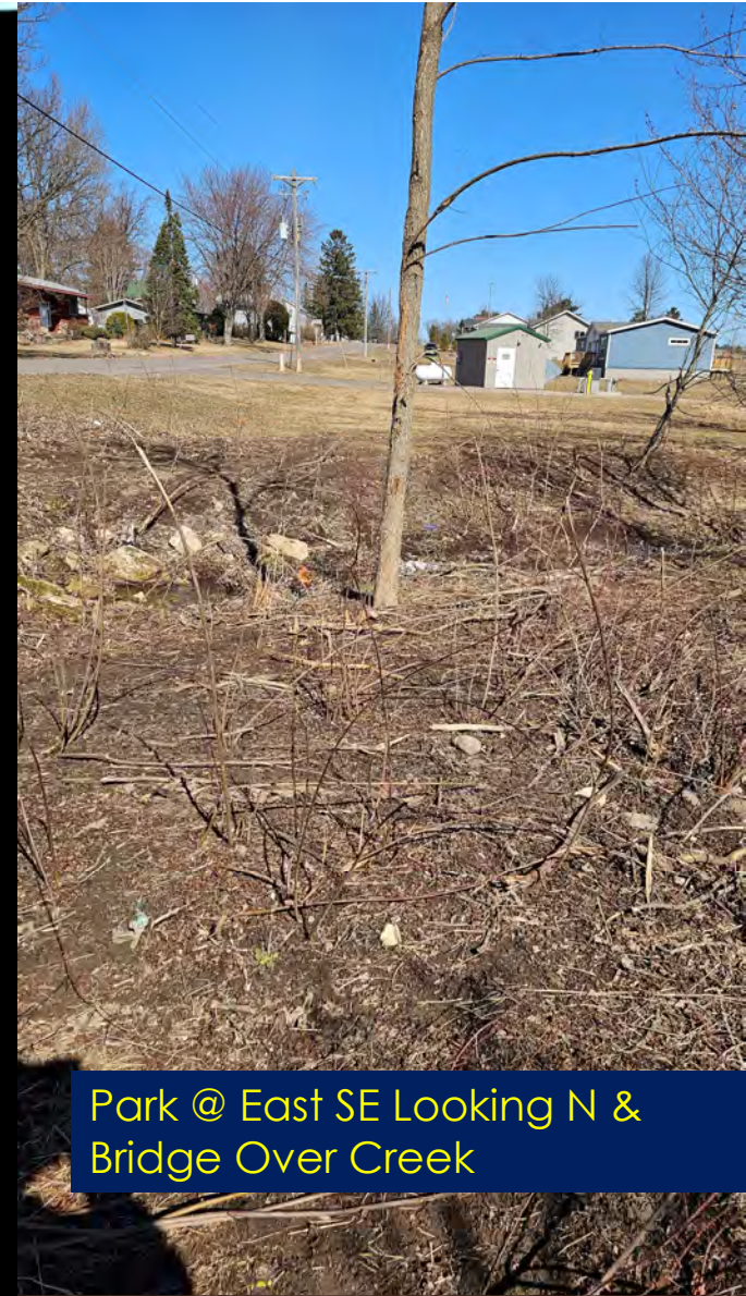
Park @ East SE Looking N & Bridge Over Creek