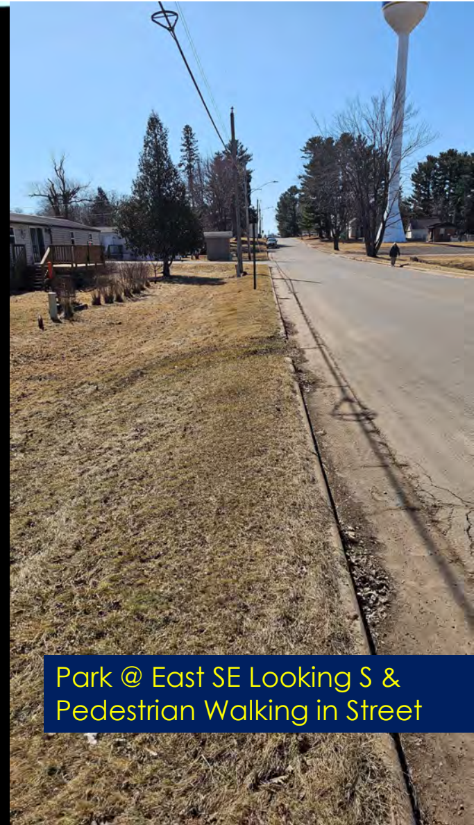
Park @ East SE Looking S & Pedestrian Walking in Street