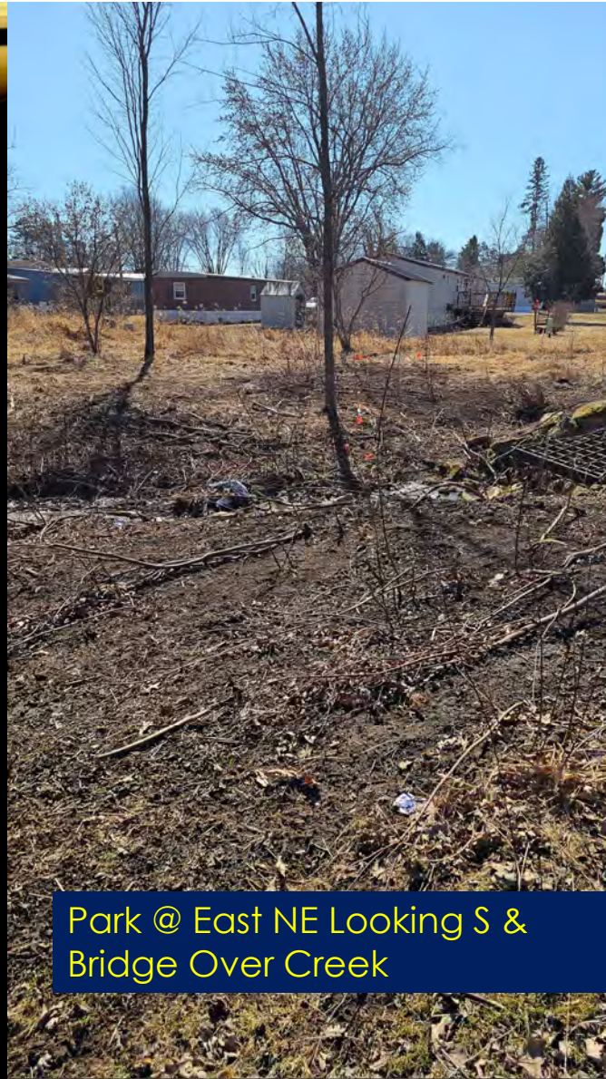
Park @ East NE Looking S & Bridge Over Creek