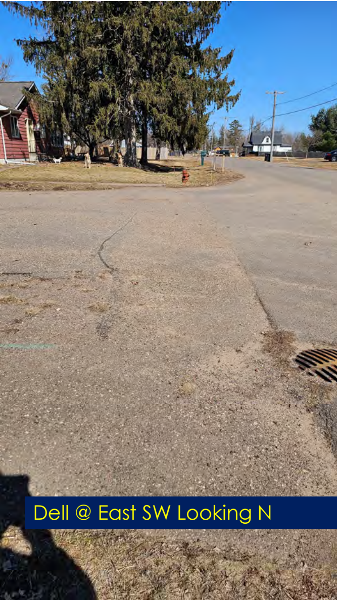
Dell @ East SW Looking N