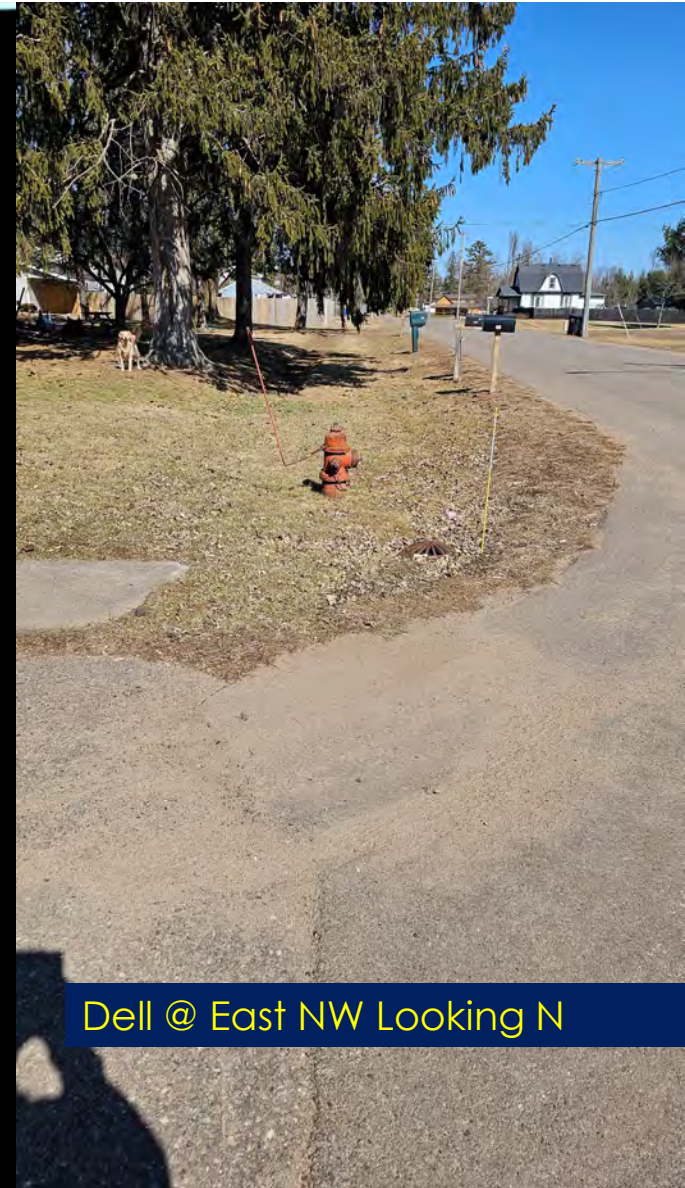
Dell @ East NW Looking N