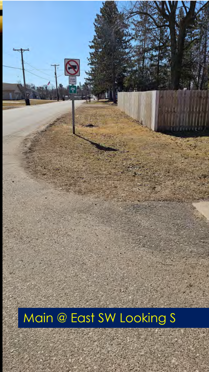
Main @ East SW Looking S