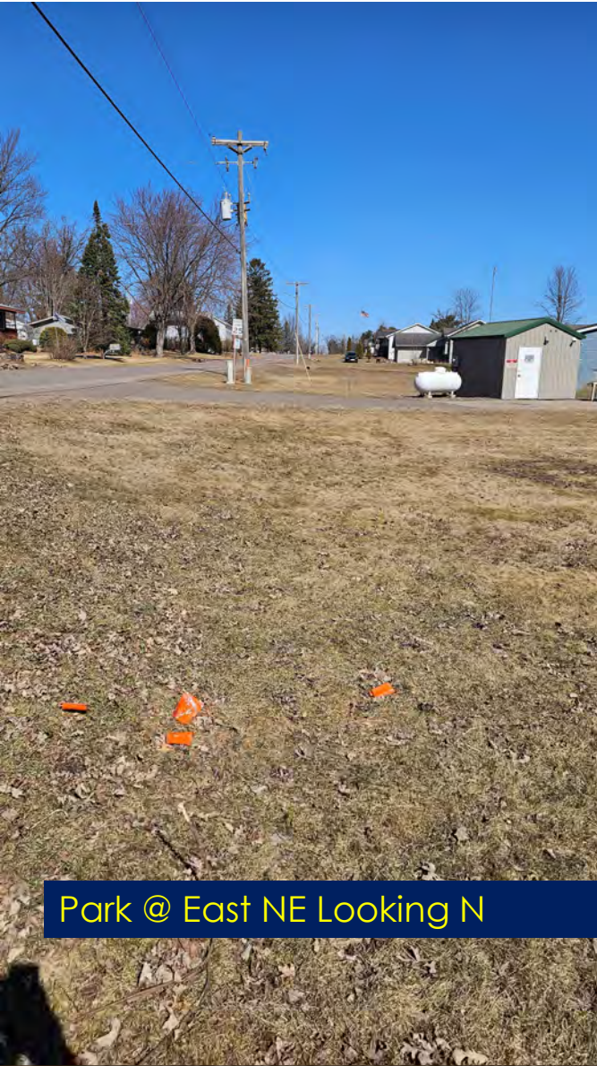
Park @ East NE Looking N