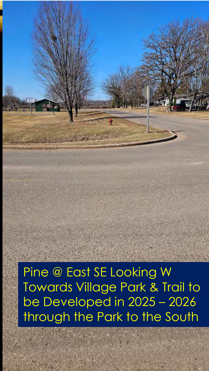
Pine @ East SE Looking W Towards Village Park & Trail to be Developed in 2025 – 2026 through the Park to the South