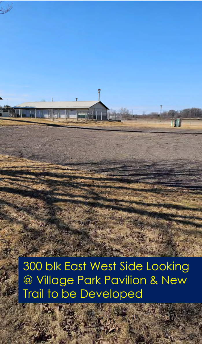
300 blk East West Side Looking @ Village Park Pavilion & New Trail to be Developed