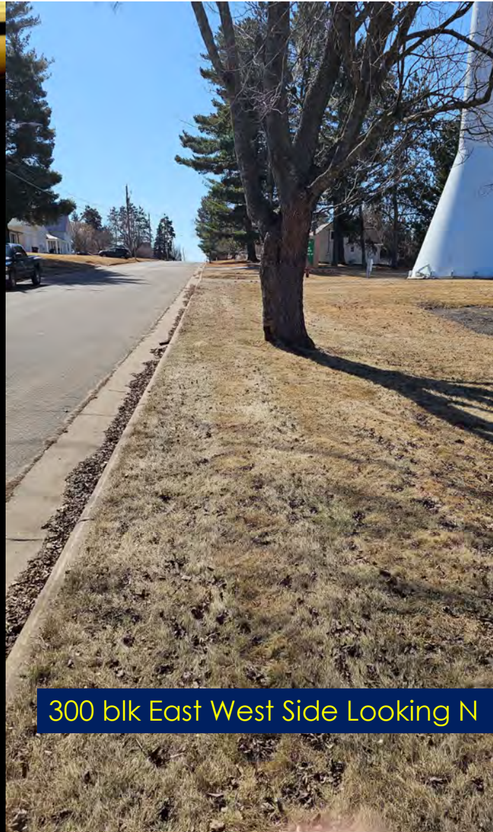
300 blk East West Side Looking N