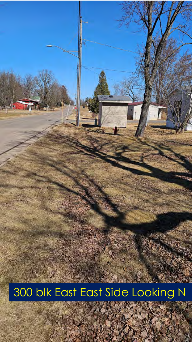
300 blk East East Side Looking N